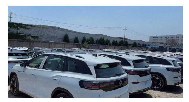
Warehouse in Shanghai